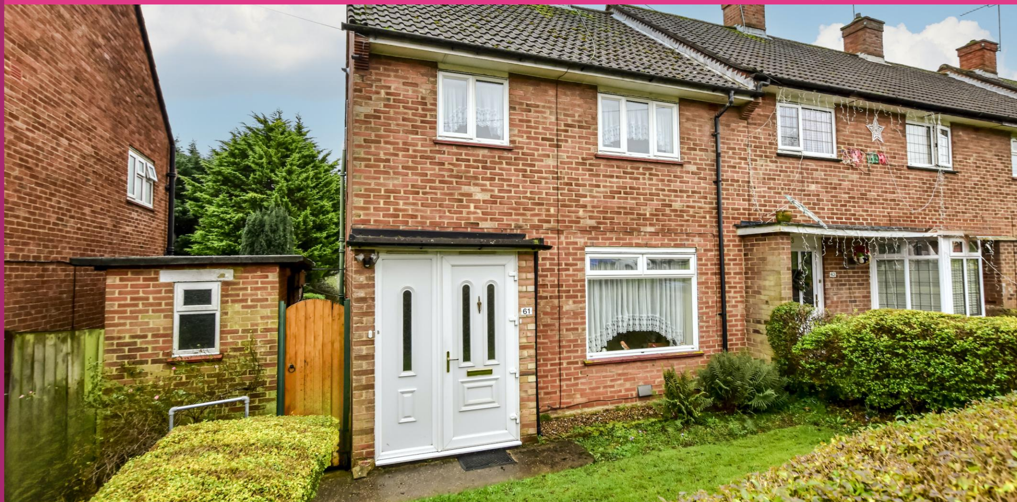
NEWHOUSE CRESCENT, WATFORD - £455,000 3 Bedroom End Terraced House