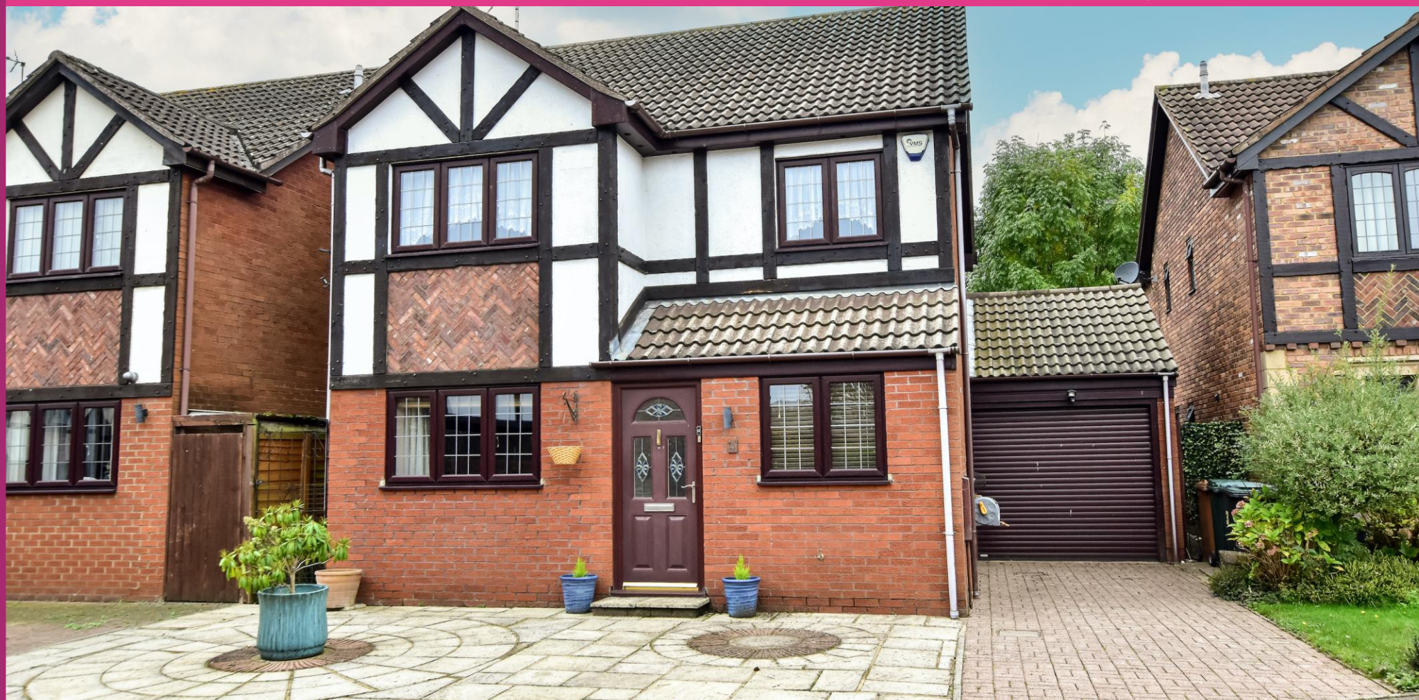
TUDOR MANOR GARDENS, WATFORD - £630,000 3 Bedroom Detached House