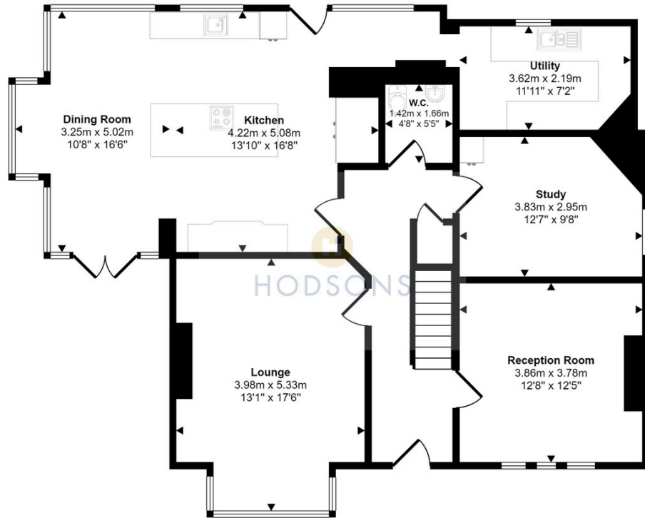
Ground Floor Approx 110 sq m / 1184 sq ft

This floorplan is only for illustrative purposes and is not to scale. Measurements of rooms, doors, windows, and any items are approximate and no responsibility is taken for any error, omission or mis-statement. Icons of items such as bathroom suites are representations only and may not look like the real items. Made with Made Snappy 360.