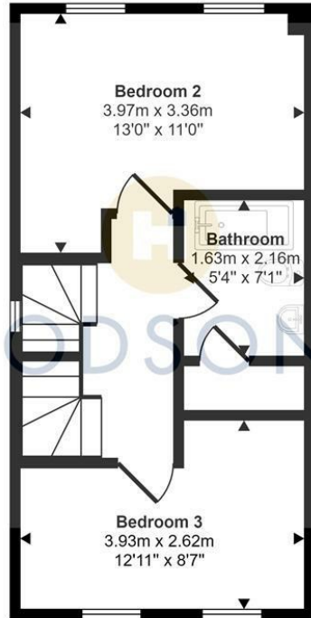
First Floor Approx 33 sq m / 353 sq ft