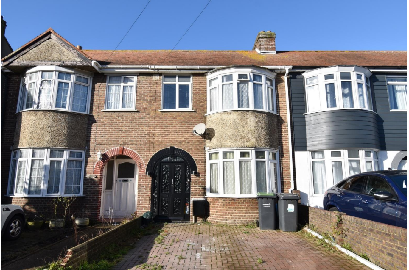
Rothsay Road, Elson, Gosport, Hampshire, PO12 4PU £265,000 Freehold