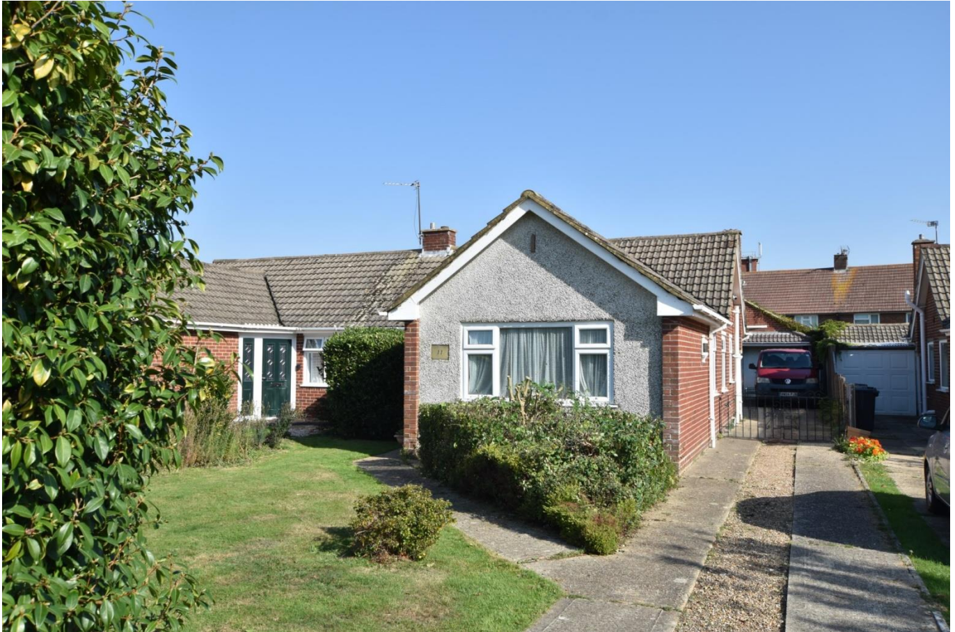
Halsey Close, Alverstoke, Gosport, Hampshire, PO12 2PJ £399,995 Freehold

6 Stokesway, Stoke Road, Gosport, Hampshire. PO12 1PE