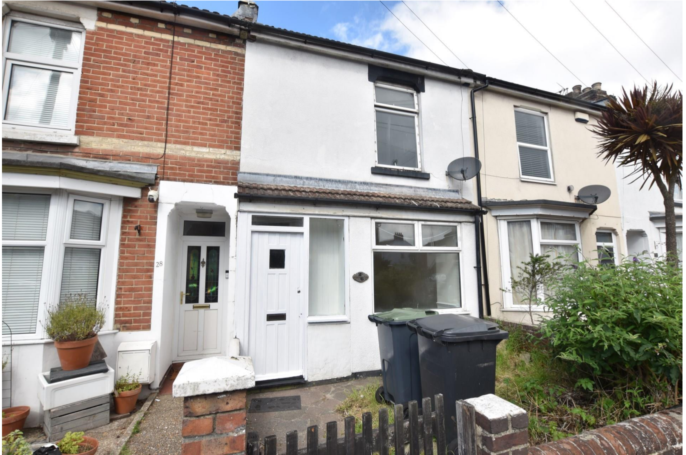
Whitworth Road, Gosport, Hampshire, PO12 3NN £199,995 Freehold