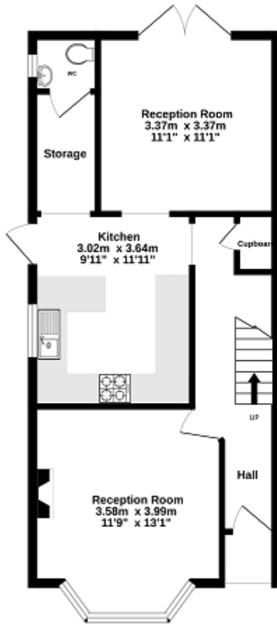
Ground Floor 48.6 sq.m. (524 sq.ft.) approx.