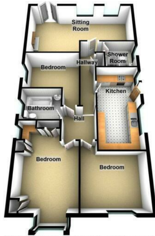
Total area: approx. 99.4 sq. metres (1069.4 sq. feet) Prepared By david-mortimer.com Not To Scale For Identification Purposes Only Plan produced using PlanUp.