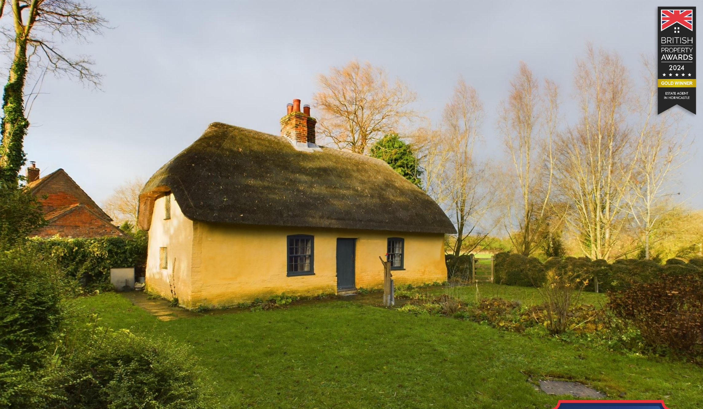
Mill Hill Cottage Back Lane, Little Steeping, Spilsby. PE23 5BL