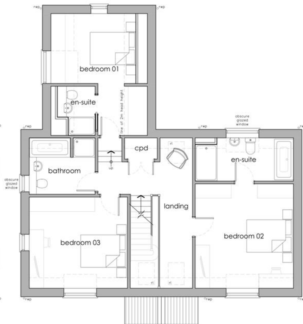
FIRST FLOOR PLAN 1:50 @ A1