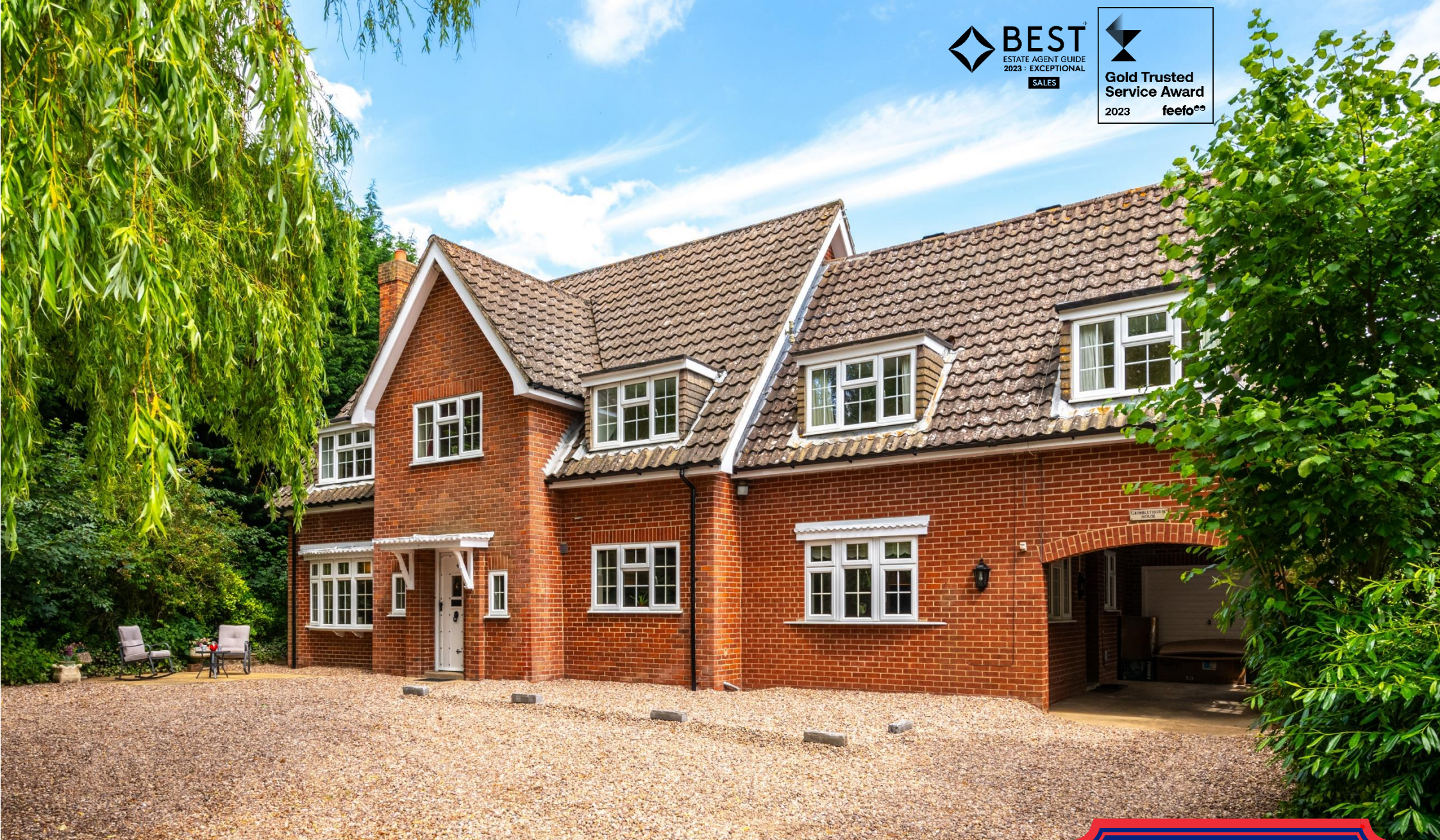
Grimblethorpe House Grimblethorpe, Louth, Lincolnshire. LN11 0RB