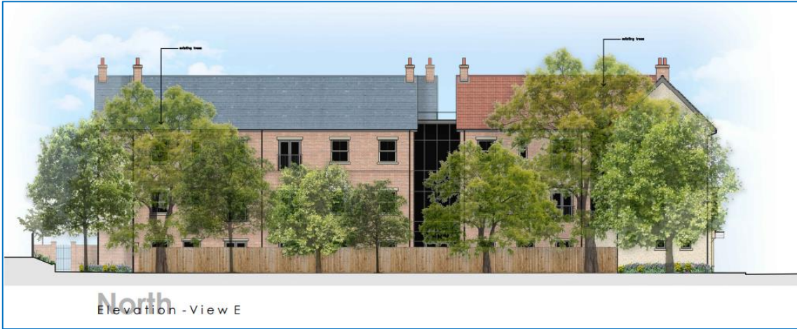
North Elevation - View E