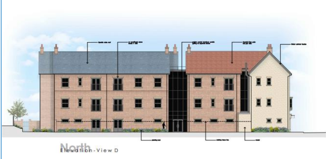
North Elevation - View D