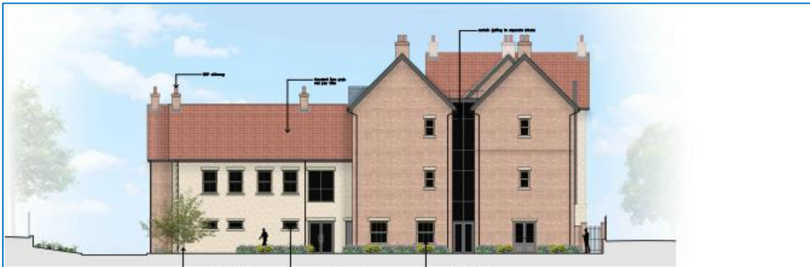
East Elevation - View C