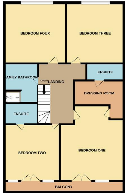
1ST FLOOR 900 sq.ft. (83.6 sq.m.) approx.