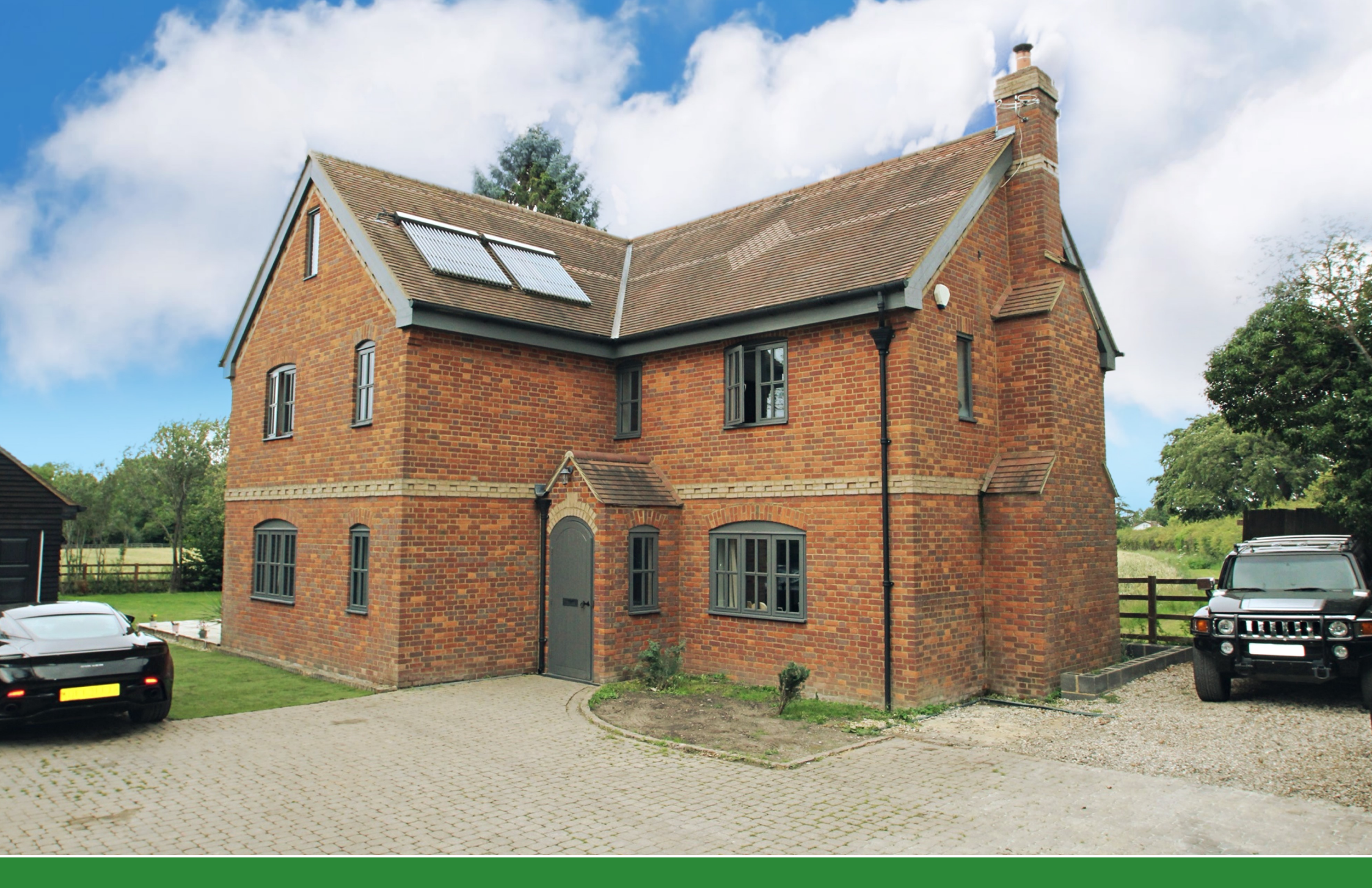
The Chestnuts, Risborough Road, Terrick, HP17 0UA