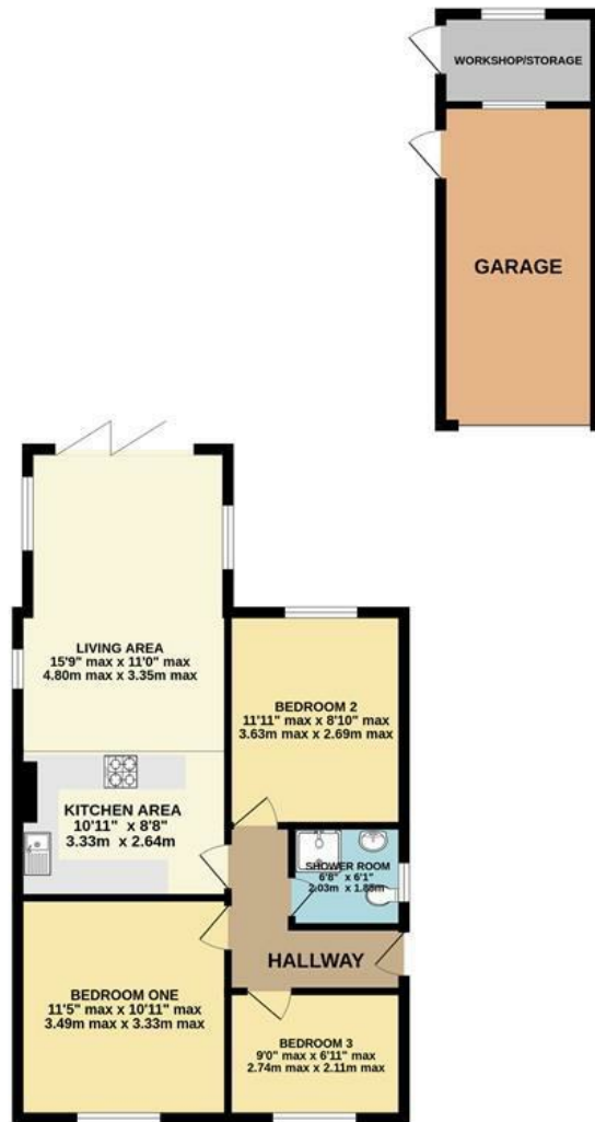
3 BEDROOM SEMI DETACHED BUNGALOW

Whilst every attempt has been made to ensure the accuracy of the floorplan contained here, measurements of doors, windows, rooms and any other items are approximate and should not be relied upon for any prospective purchaser. This plan is for illustrative purposes only and does not constitute an offer of any property. The services, systems and appliances shown are for illustrative purposes only and should not be relied upon for any prospective purchaser. The services, systems and appliances shown are for illustrative purposes only and should not be relied upon for any prospective purchaser. Made with Metropix ©2