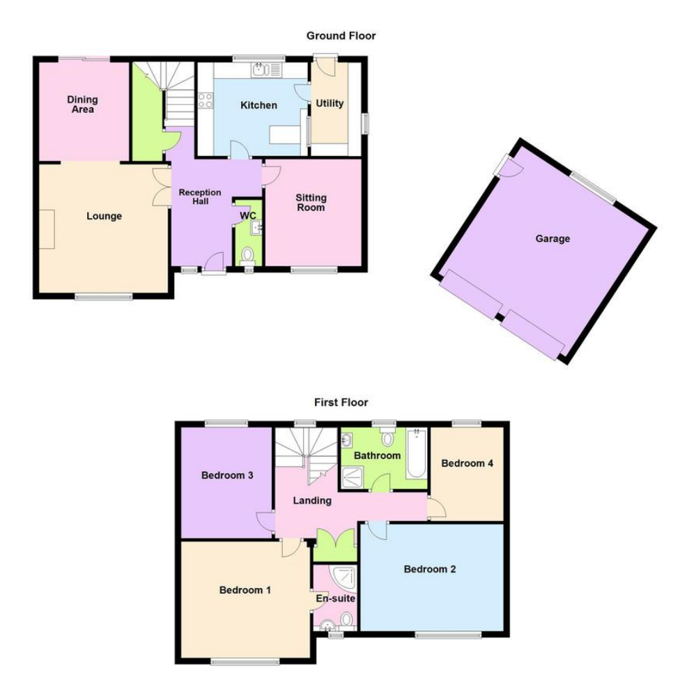
Floor plans are to show layout only and are not drawn to scale.

OUTGOINGS - The property is situated within the East Lindsey District Council and we are advised is in Property Band E.