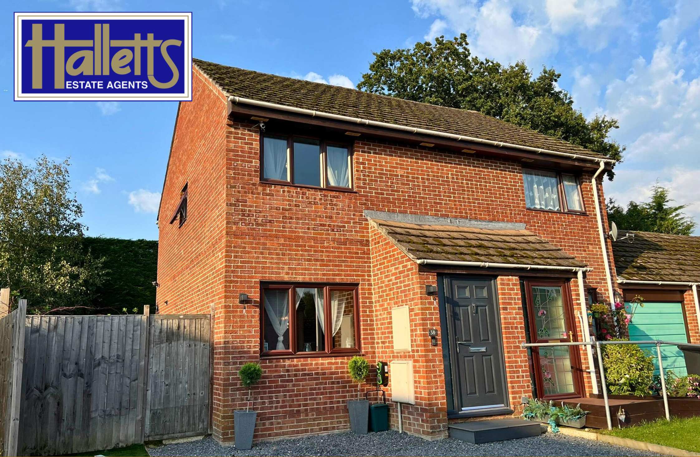
38 Billington Way Thatcham Berkshire RG18 3HG