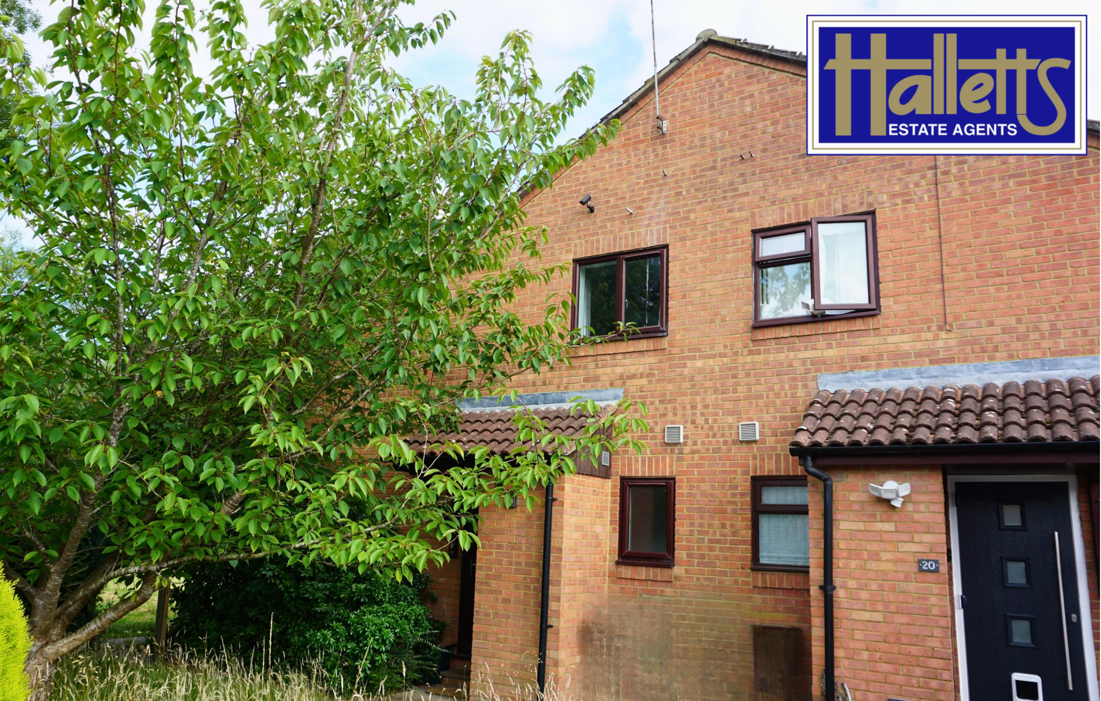
19 Alderfield Close Theale Reading Berkshire RG7 5AF