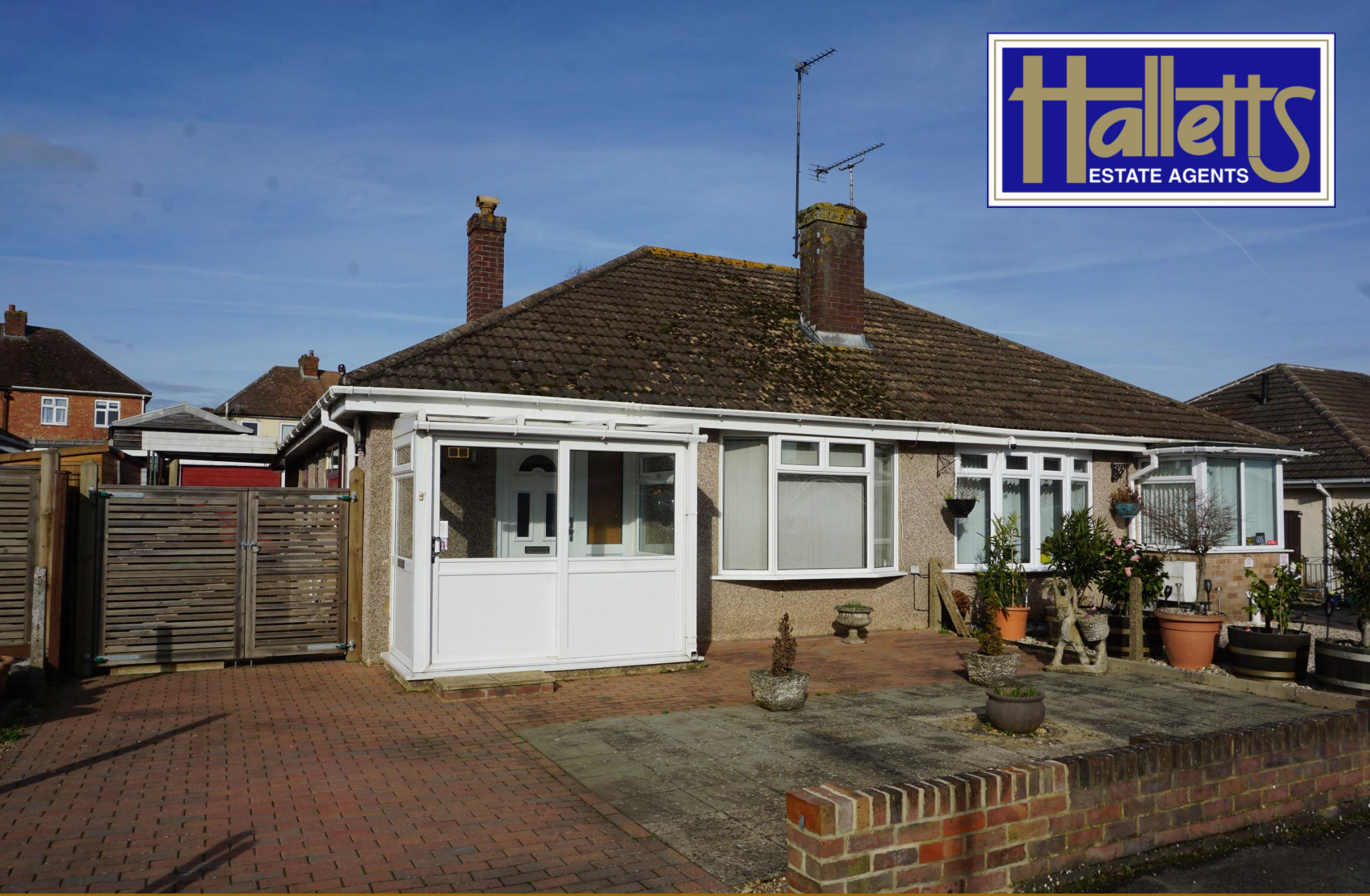
22 Barfield Road Thatcham Berkshire RG18 3BL