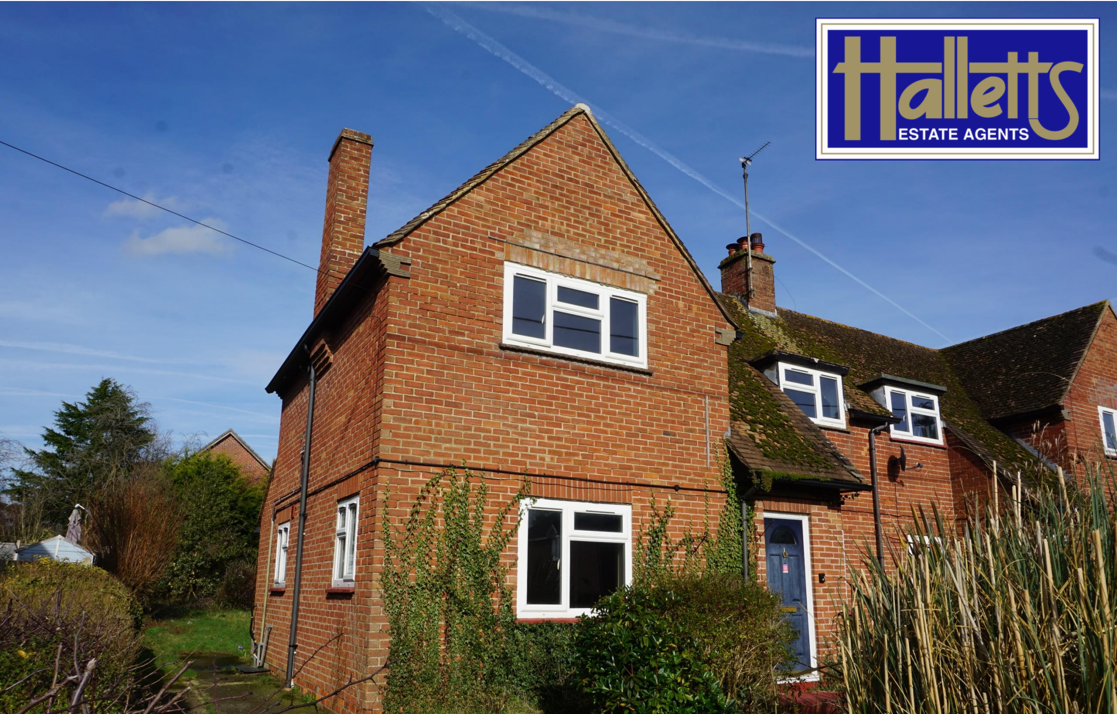
11 Westfield Road Thatcham Berkshire RG18 3EL