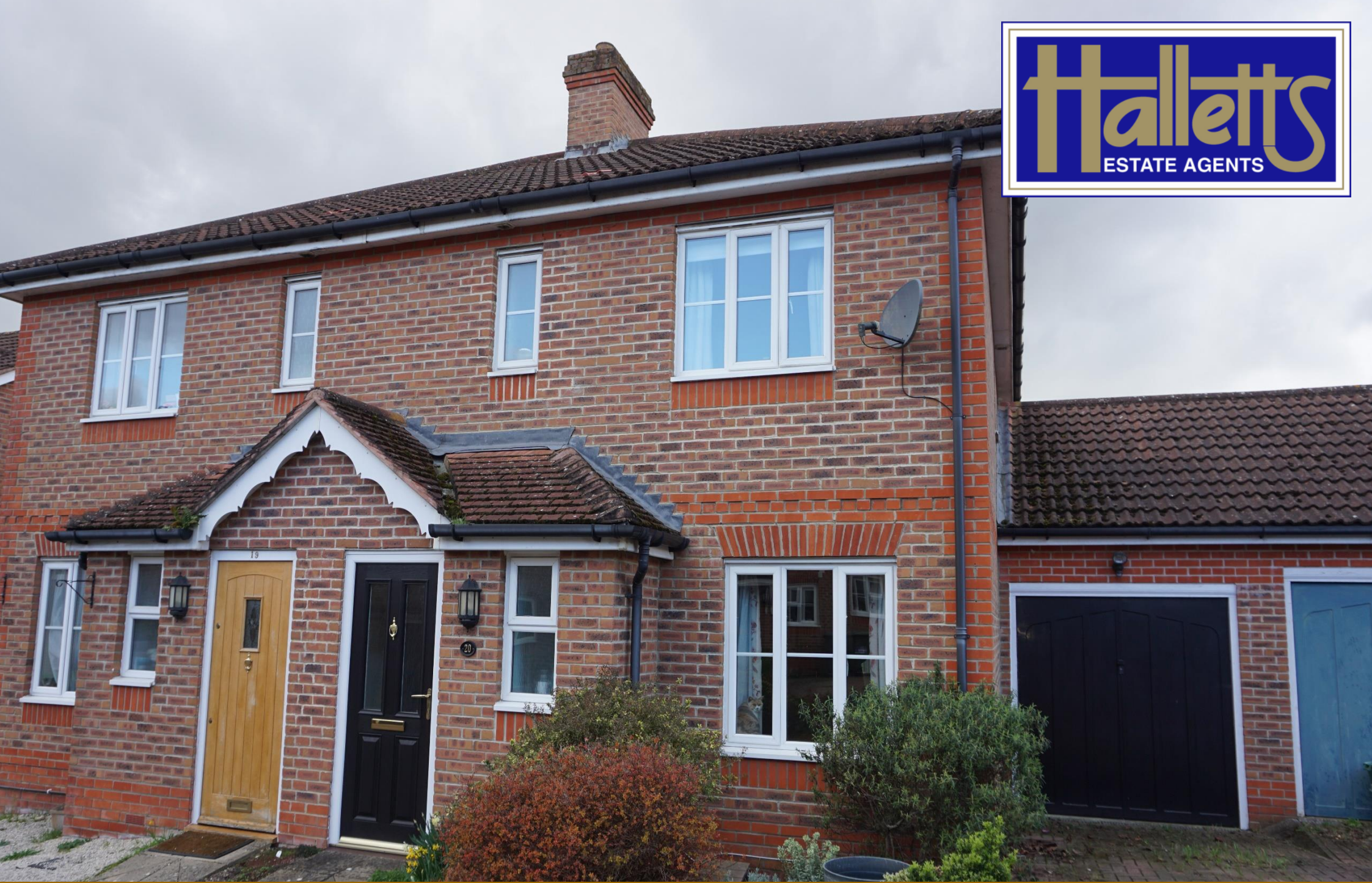
20 Leonardslee Crescent Newbury Berkshire RG14 2FB