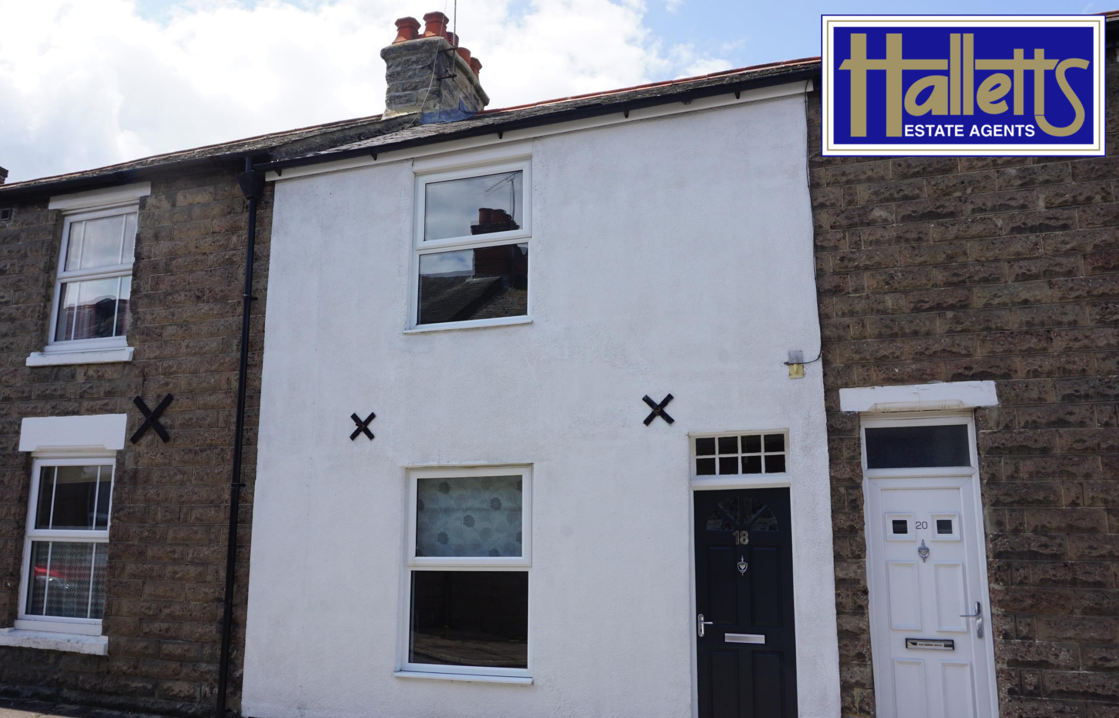
18 St Nicholas Road Newbury Berkshire RG14 5PR