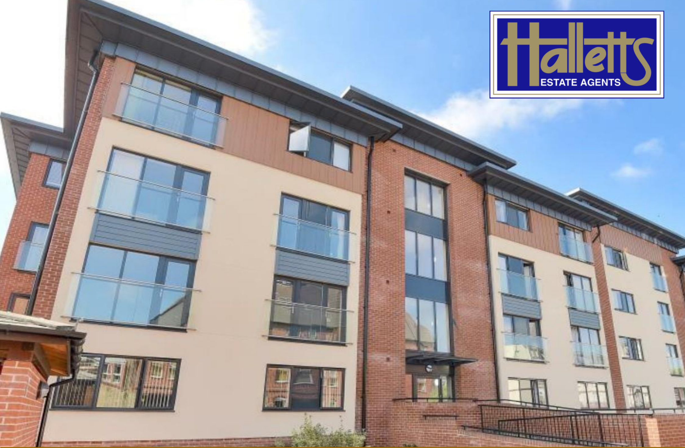
3 Hillview Place West Street Newbury Berkshire RG14 1BF