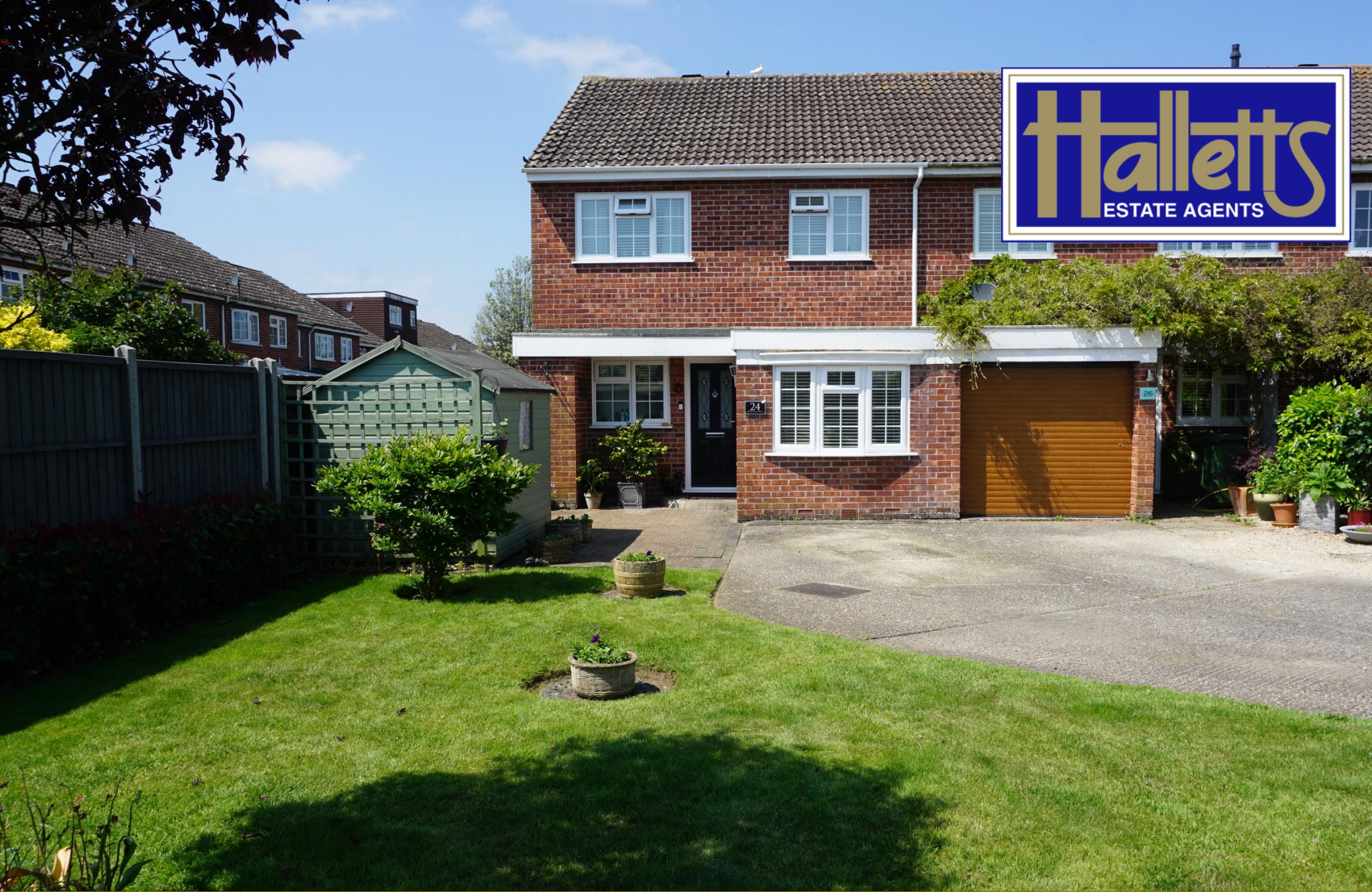
24 Winston Way Thatcham Berkshire RG19 3TY