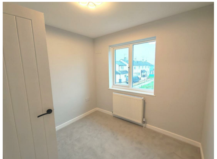
Radiator, upvc double glazed window to front, stairwell to one corner.