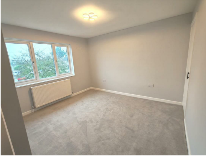
Radiator, upvc double glazed window to front.