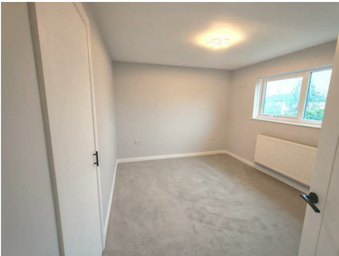
Radiator, built in cupboard, upvc double glazed window to rear.