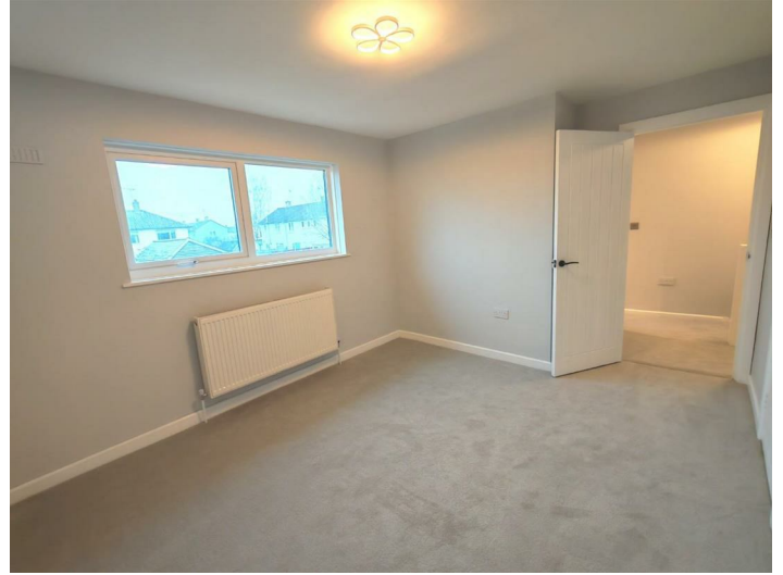
BEDROOM THREE 8'2 x 8 (2.49m x 2.44m)