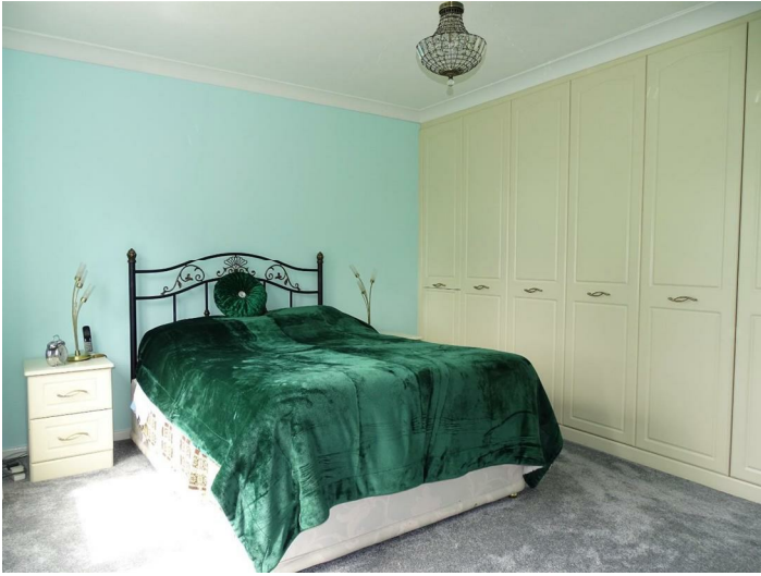
Radiator, range of fitted wardrobes, vanity drawer unit with display shelves and mirror, upvc double glazed window.