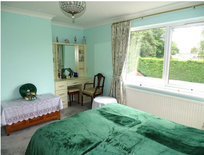
BEDROOM TWO 12'8" x 12'0" (3.88 x 3.68)