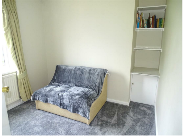
Radiator, built in double wardrobe, shelved recess with fitted cupboard, access to roof space which we understand is insulated, mostly boarded with lights and a ladder, upvc double glazed window.