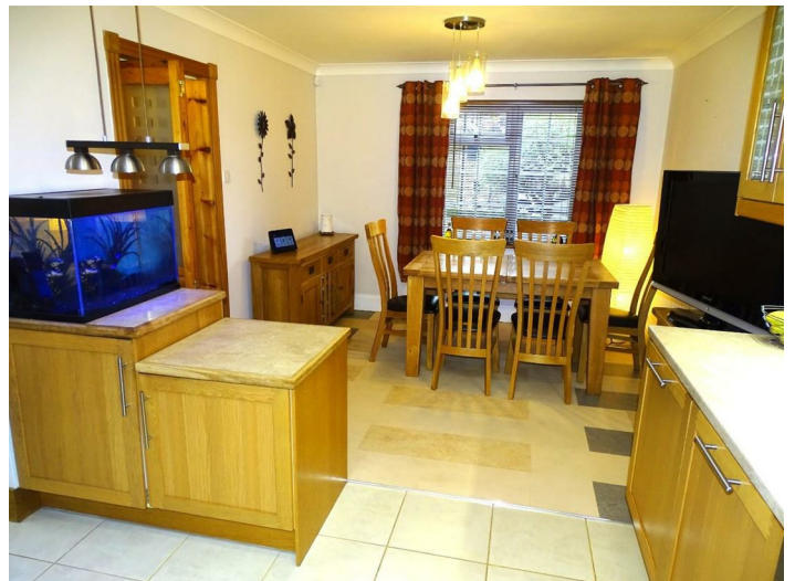
DINING VIEW FROM KITCHEN AREA

Radiator, upvc double glazed window to front.