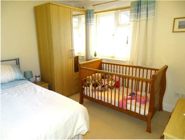
Radiator, deep built in over stair cupboard, upvc double glazed window to front.