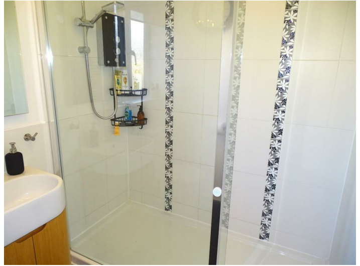
White suite comprising a walk in double shower unit, low level wc, vanity wash hand basin, heated towel rail, frosted upvc double glazed window to rear.