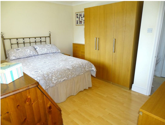
BEDROOM TWO 13'2" x 10'6" (4.03 x 3.21)