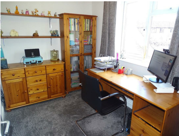
Radiator, upvc double glazed window to rear.