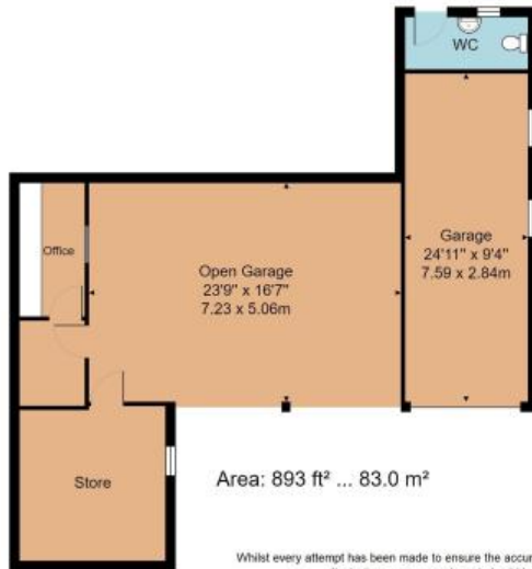
Area: 893 ft 2 ... 83.0 m 2