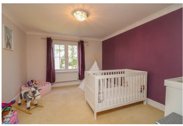
BEDROOM THREE 10' 5" x 9' 1" (3.18m x 2.77m)

Double glazed window to front aspect. Radiator. Fitted wardrobes.