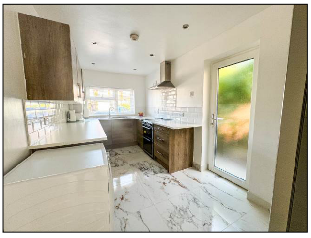
Guide Price: £475,000 - £500,000

Situated in a popular location is this immaculate, three good size bedroom detached chalet benefiting from having large lounge, modern kitchen, recently fitted ground floor shower room and first floor bathroom, approximately 100ft SOUTH EAST FACING rear garden and own block paved driveway providing ample off street parking.