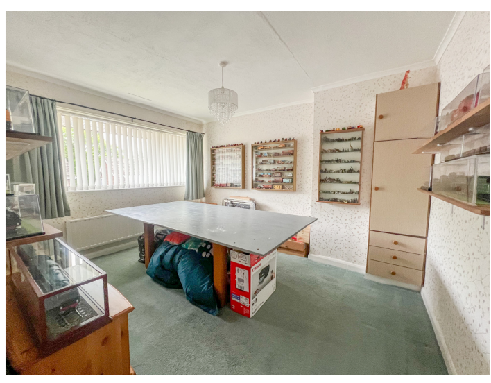
BEDROOM THREE 11' 6" x 11' 4" (3.51m x 3.45m) Double glazed window to rear aspect. Radiator. Texture

Double glazed window to front aspect. Radiator. Textured ceiling.