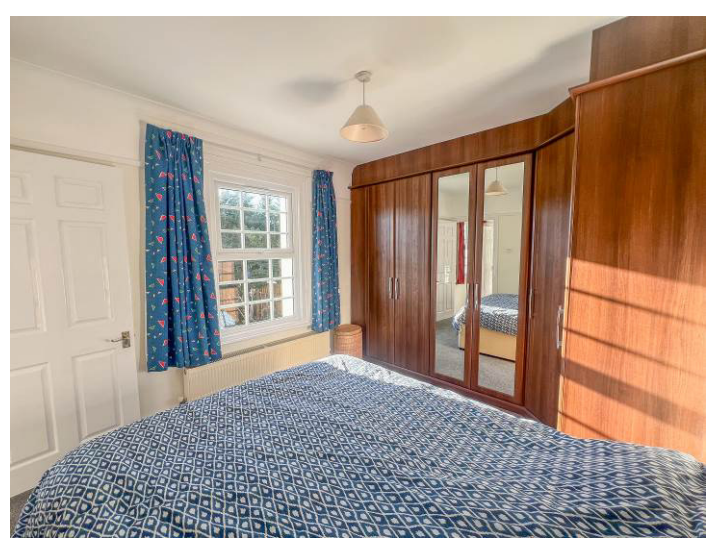
BEDROOM THREE 10' 11" max x 10' 2" max (3.33m x 3.1m)

Recently fitted double glazed Georgian style window to the rear aspect. Fitted wardrobes to one wall. Coving to plastered ceiling. Radiator.