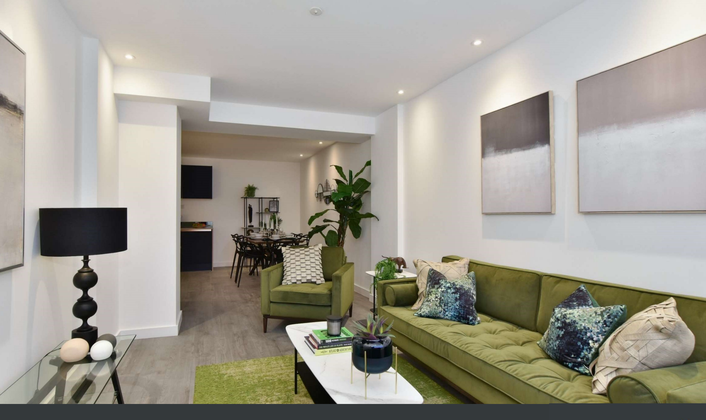
Plot 2, Rembrandt House, 400 Whippendell Road, Watford, WD18 7PG Guide price: £390,000 Leasehold