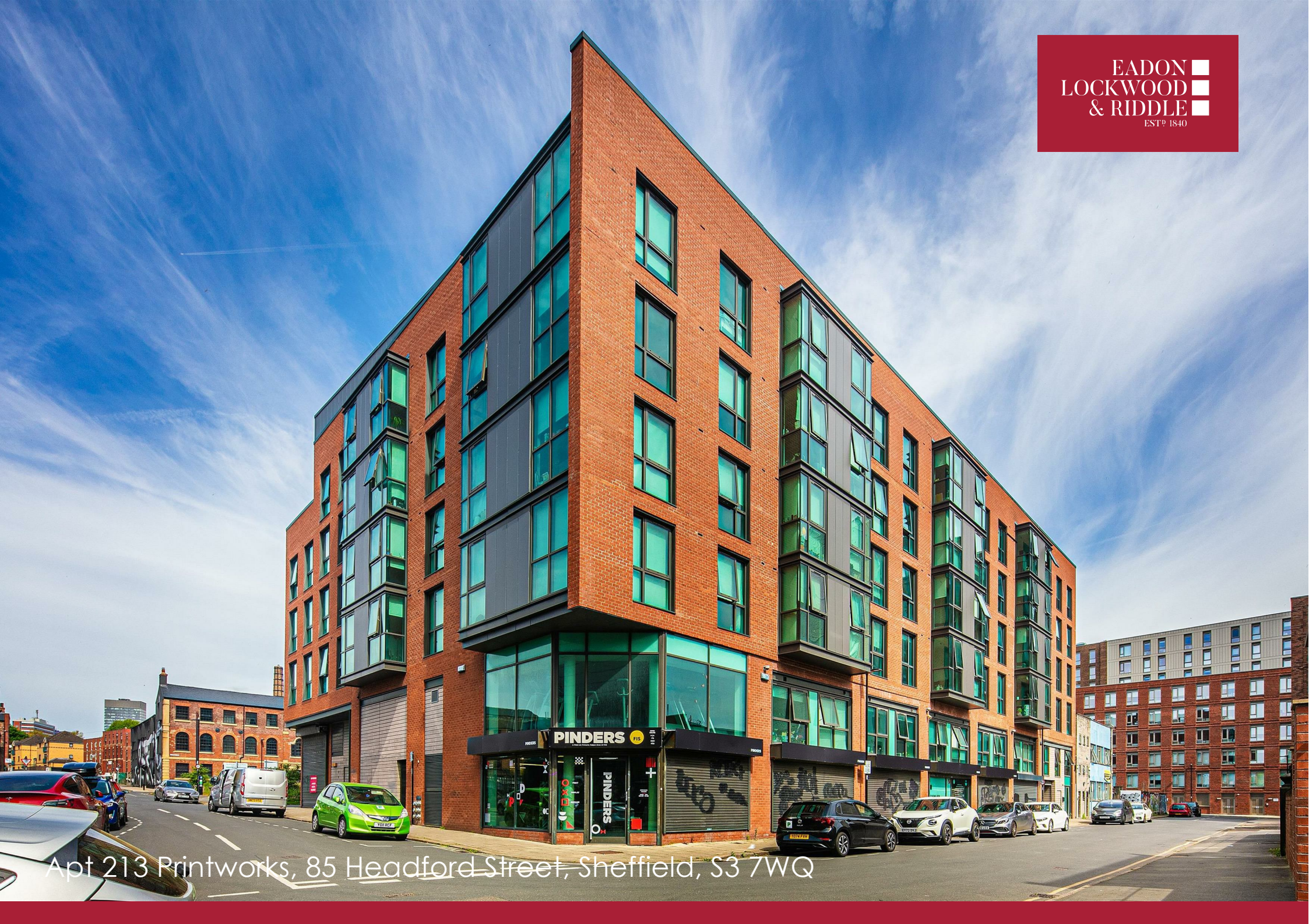
Apt 213 Printworks, 85 Headford Street, Sheffield, S3 7WQ