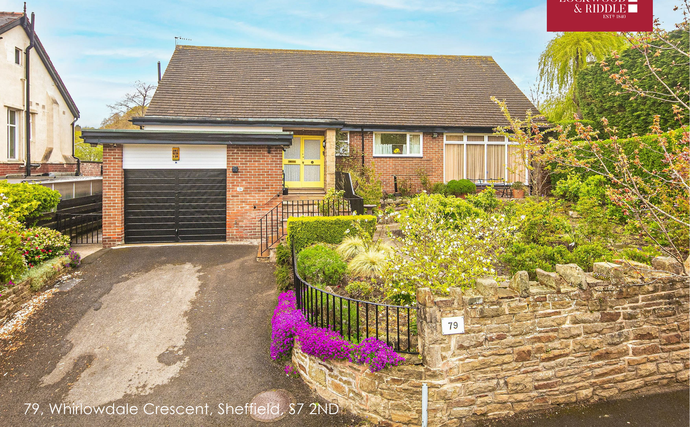
79, Whirlowdale Crescent, Sheffield, S7 2ND