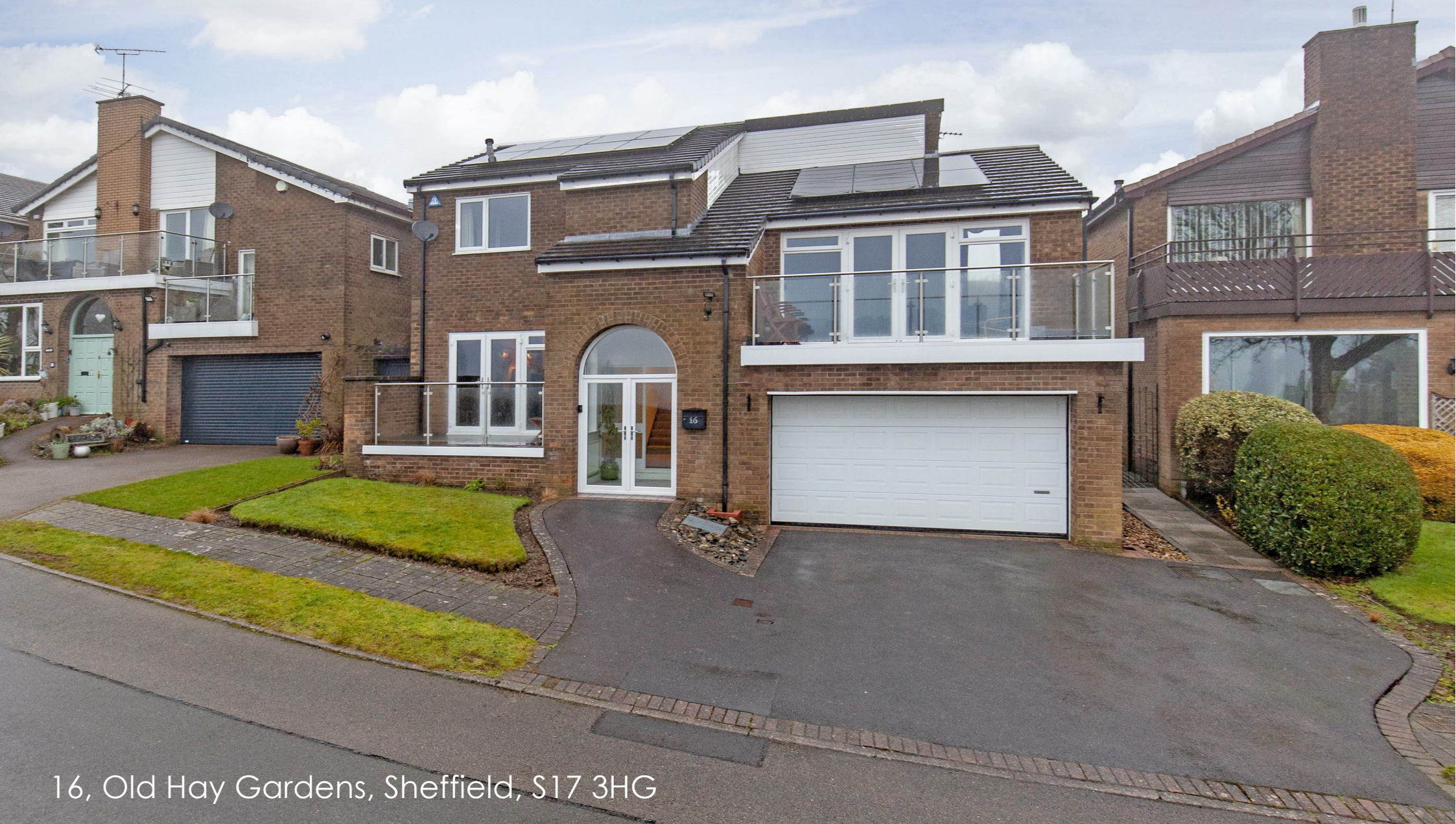
16, Old Hay Gardens, Sheffield, S17 3HG