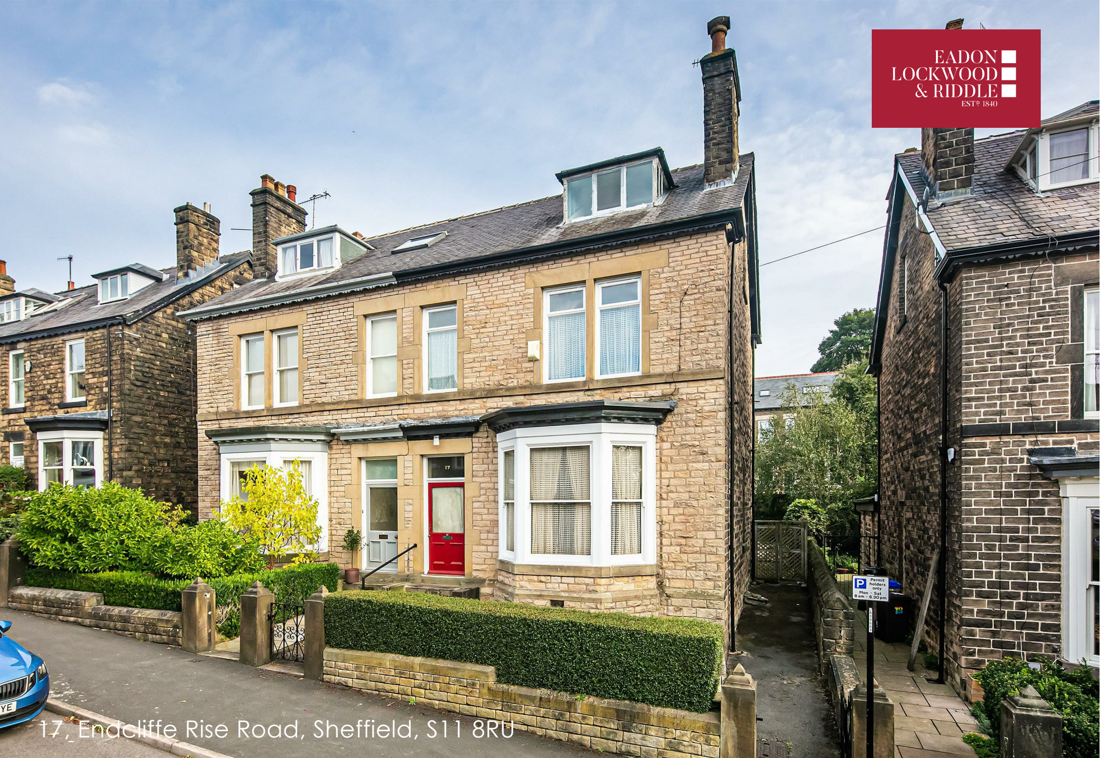
17, Endcliffe Rise Road, Sheffield, S11 8RU