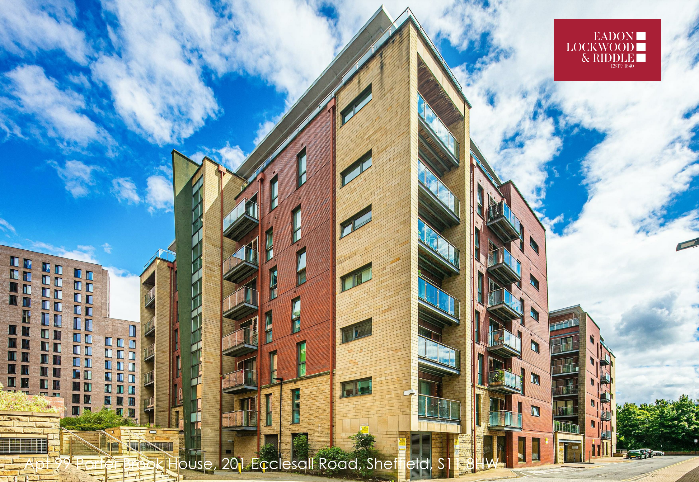
Apt 99 Porter Brook House, 201 Ecclesall Road, Sheffield, S11 8HW