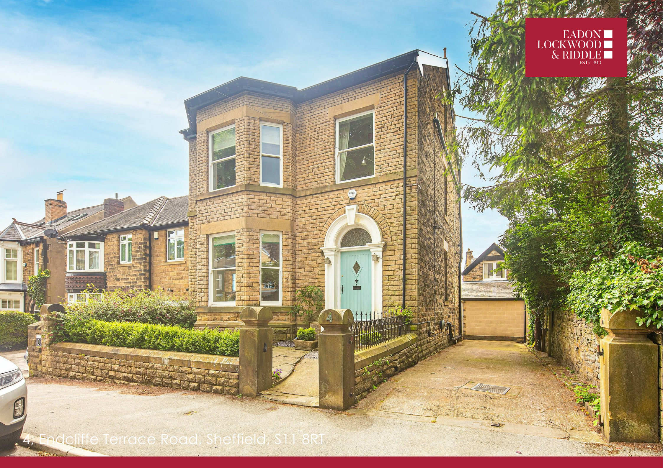
4, Endcliffe Terrace Road, Sheffield, S11 8RT