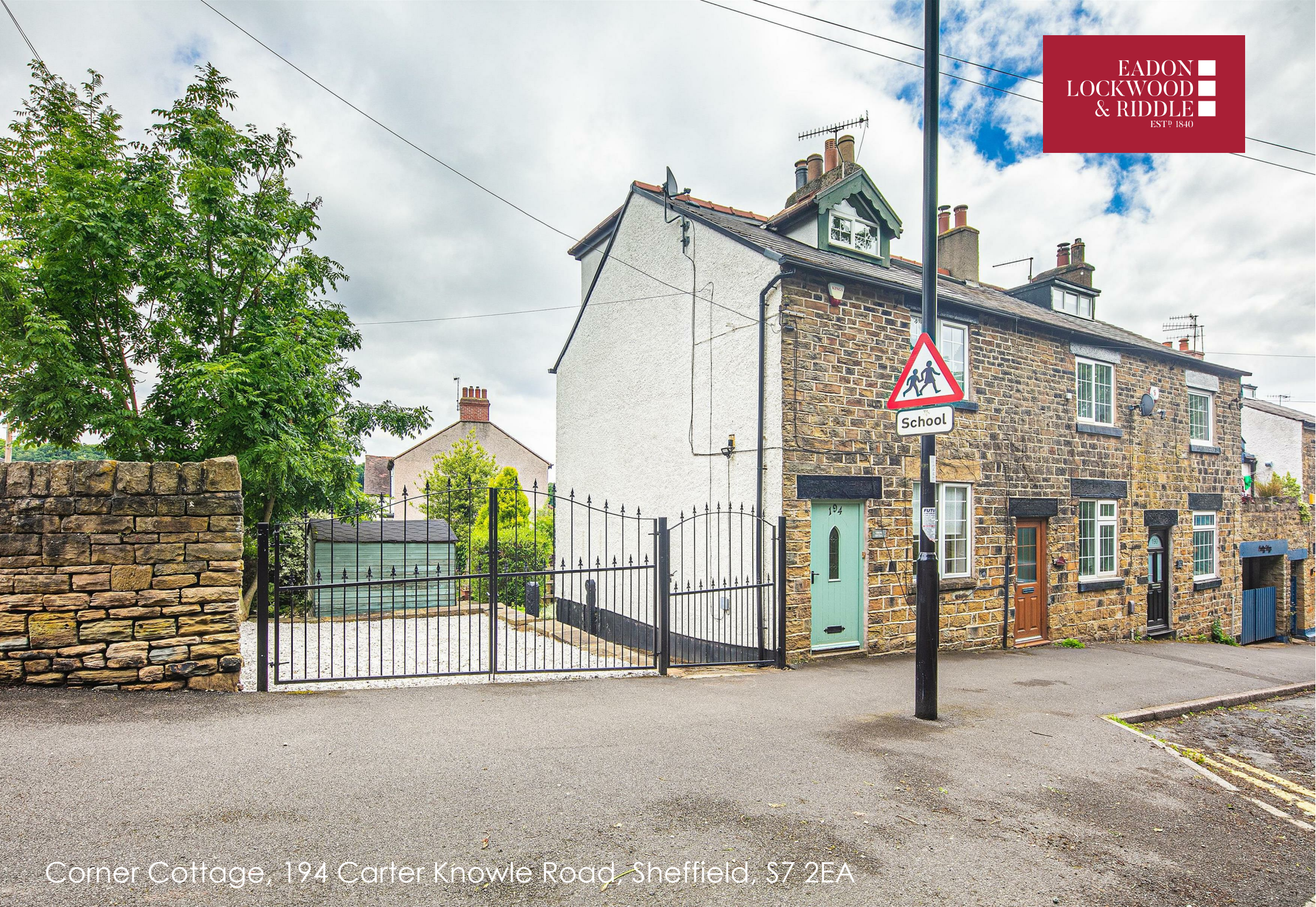
Corner Cottage, 194 Carter Knowle Road, Sheffield, S7 2EA