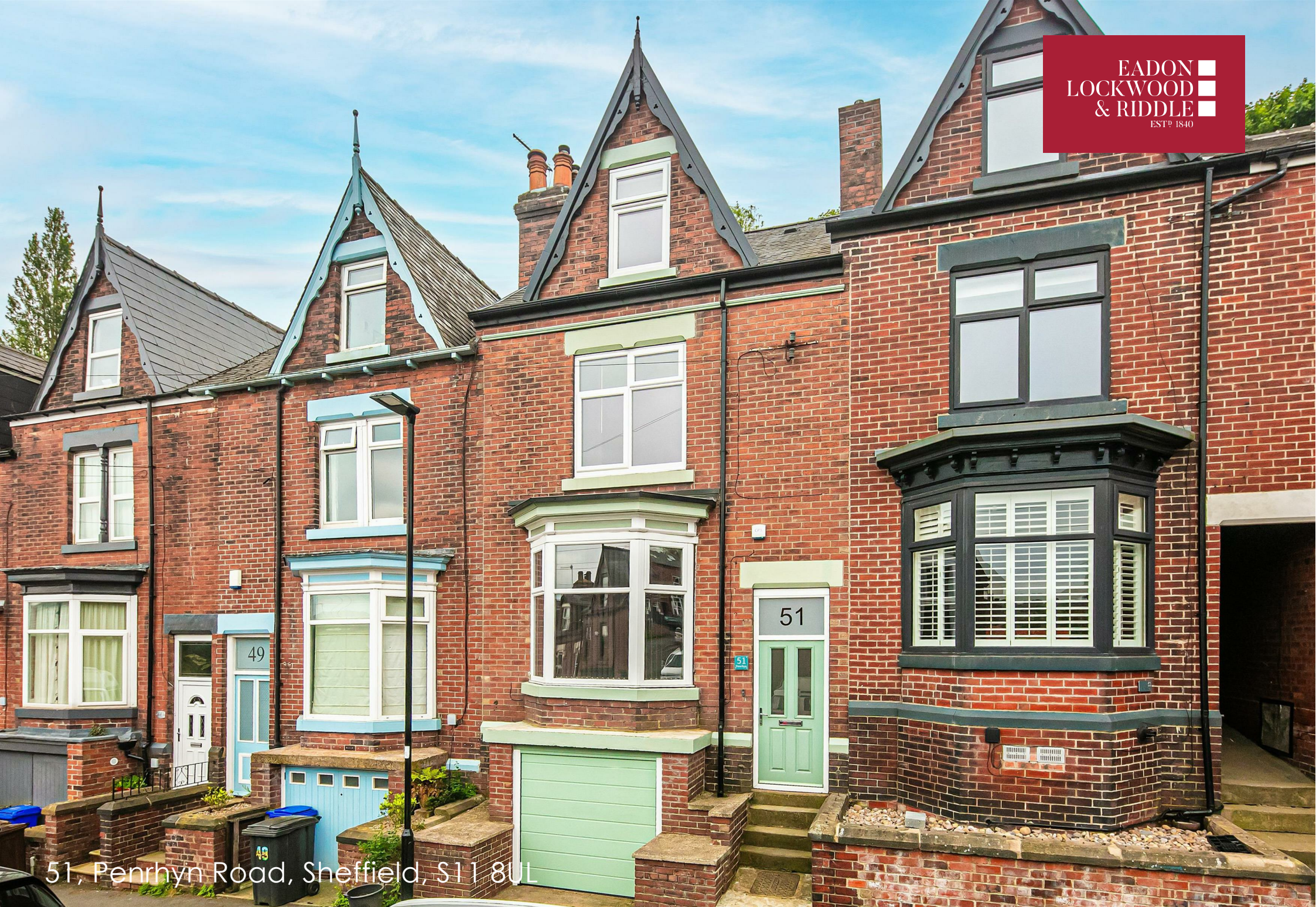
51, Penrhyn Road, Sheffield, S11 8UL