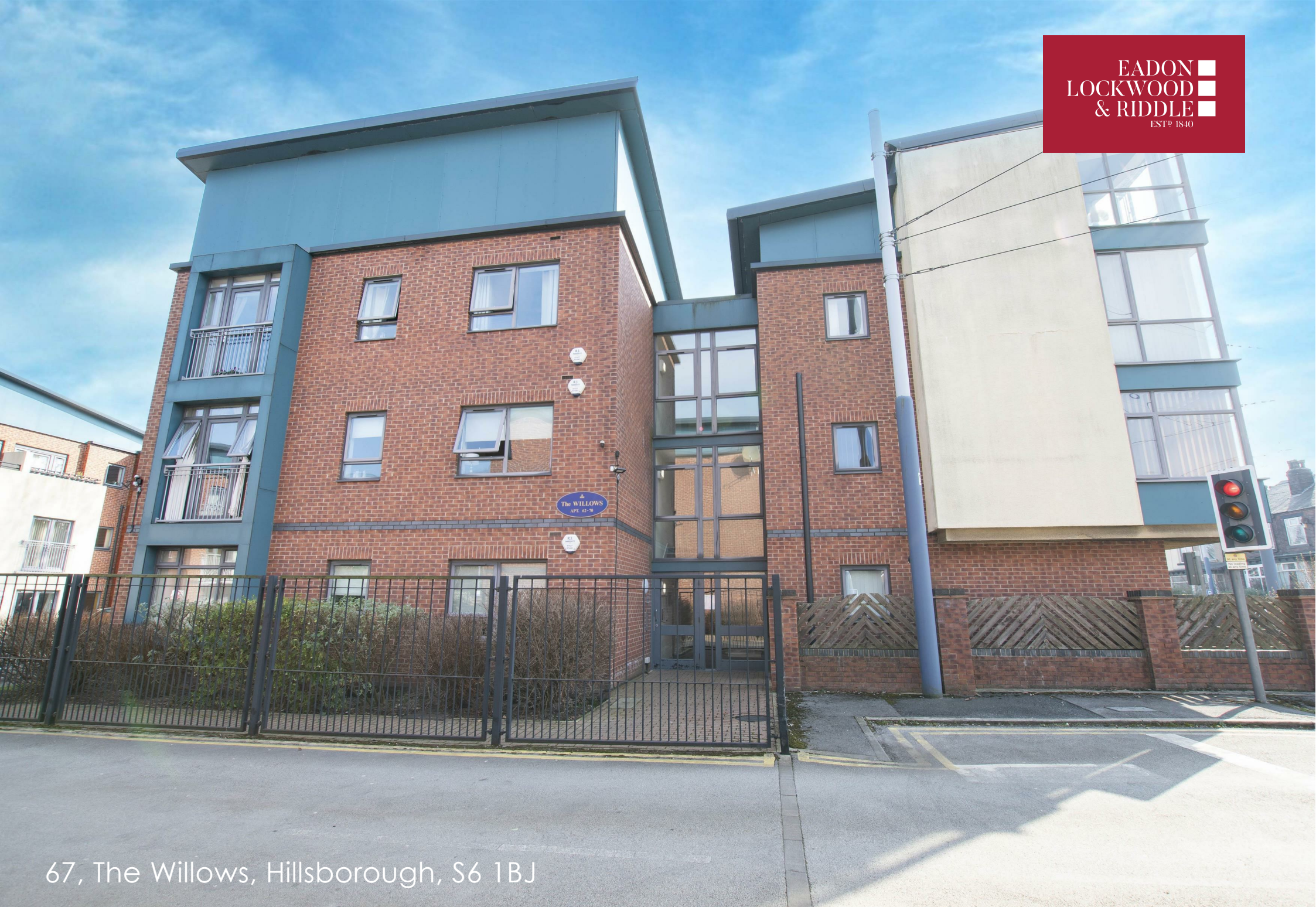
67, The Willows, Hillsborough, S6 1BJ