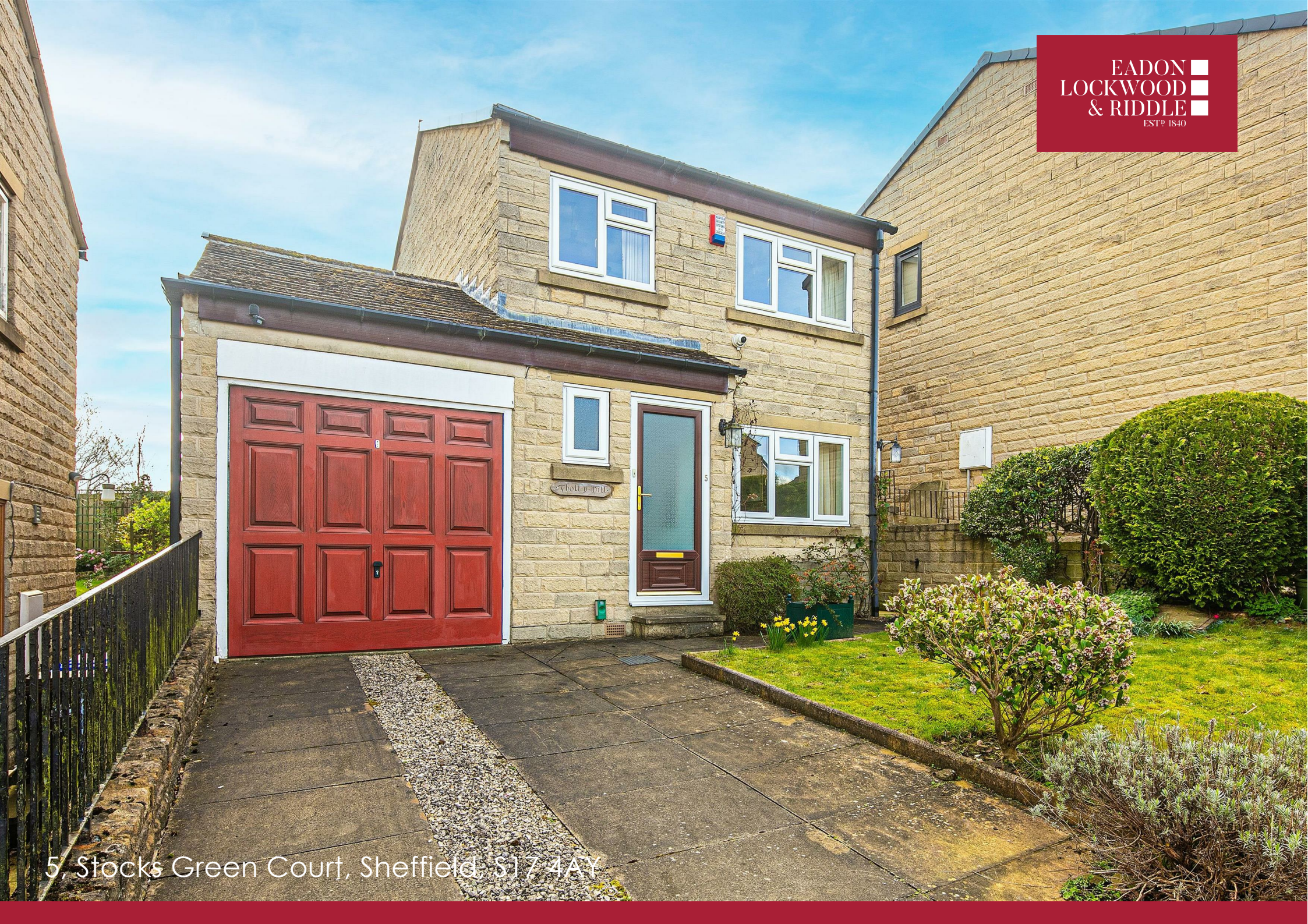
5, Stocks Green Court, Sheffield, S17 4AY