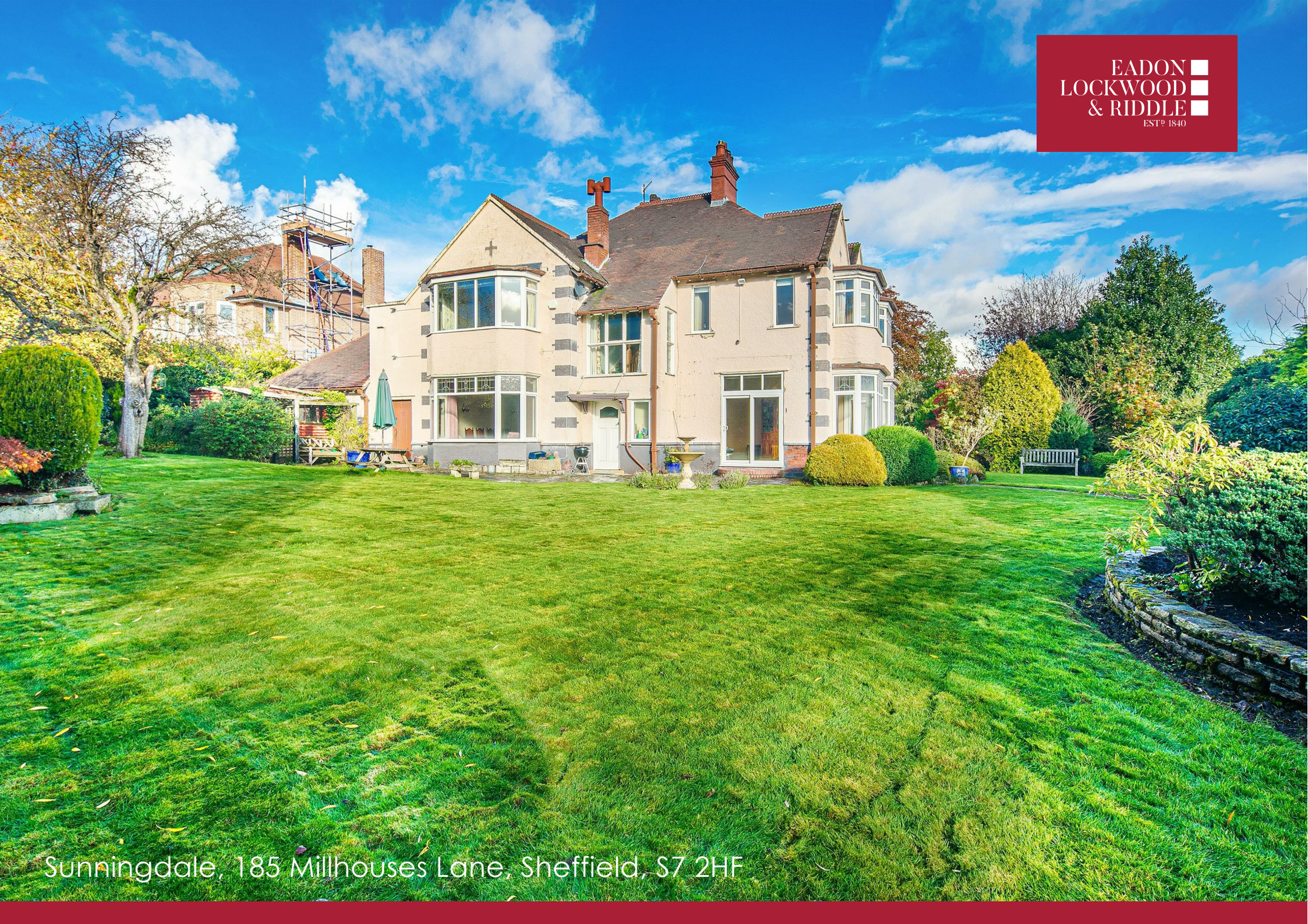
Sunningdale, 185 Millhouses Lane, Sheffield, S7 2HF