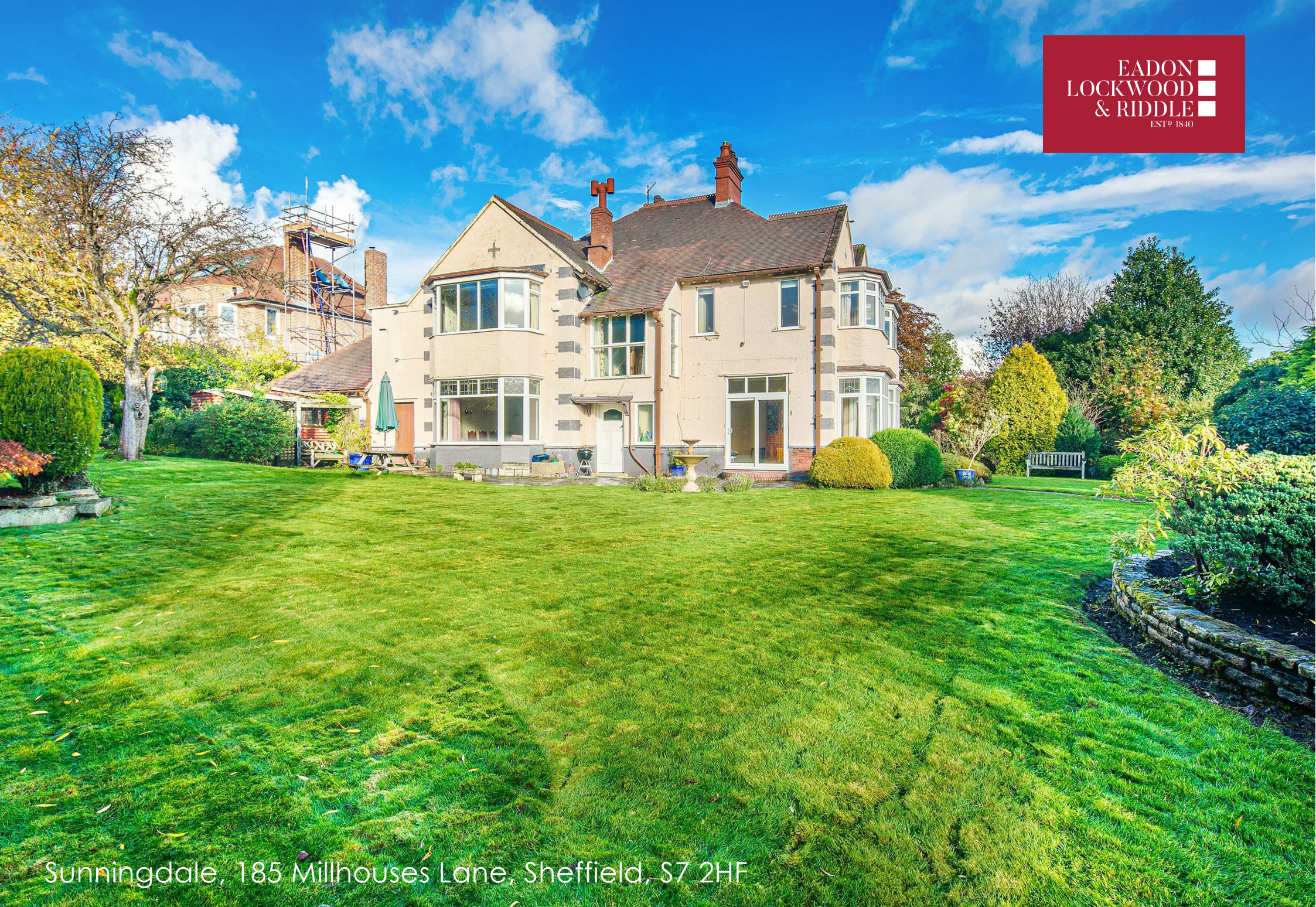
Sunningdale, 185 Millhouses Lane, Sheffield, S7 2HF