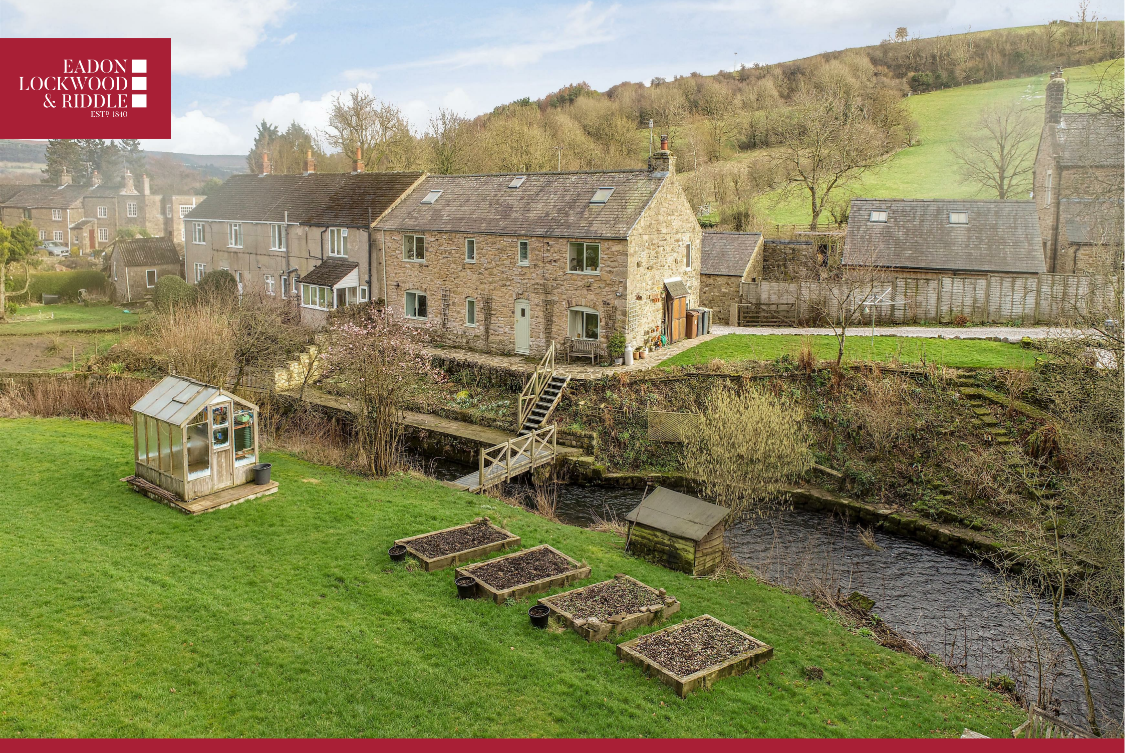
The Barn, Brough, Bradwell, Hope Valley, $33 9HG