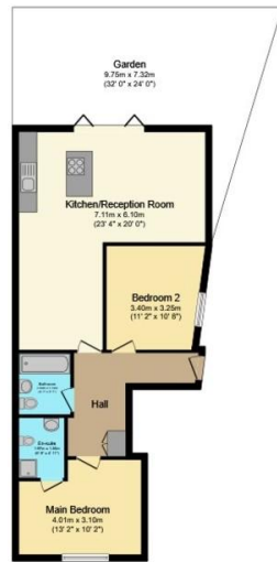
Ground Floor Floor area 70.1 m 2 (755 sq.ft.)