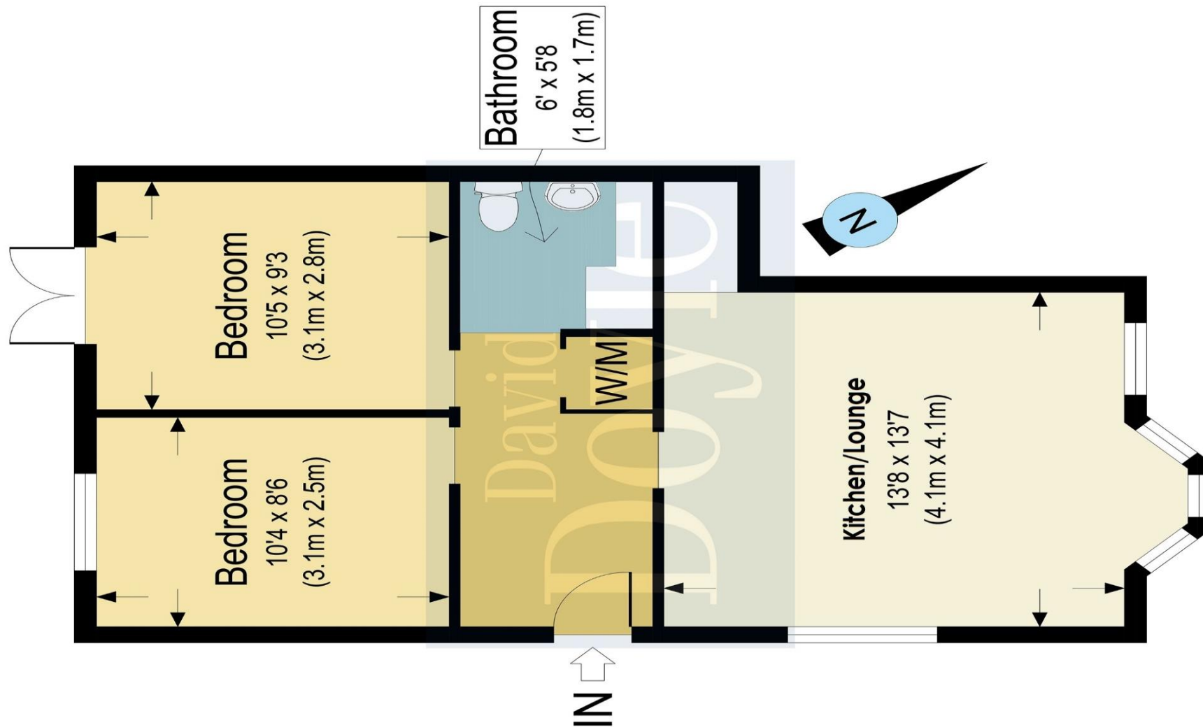
64 Turners Hill - Ground Floor New

Call 01442 248671 to arrange a viewing or register an interest