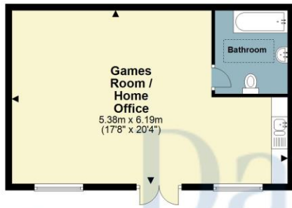
Ground Floor Approx. 126.2 sq. metres (1358.0 sq. feet)